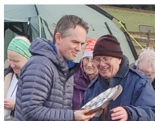
Some of the winners at The East Midlands Championships